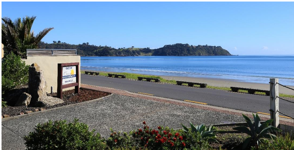
Onetangi Beach Apartments